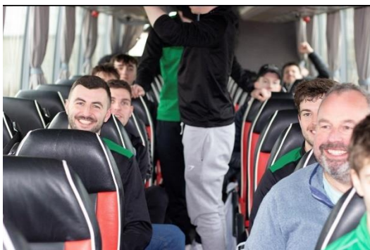
Players & supporters away bus