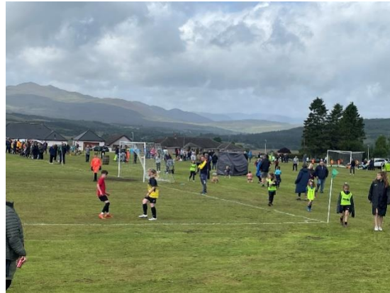
Lochbroom our P4/7 Kyle Cup winners 🏆👏