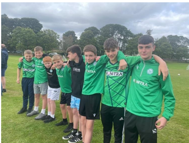
Secondary members support their senior team.